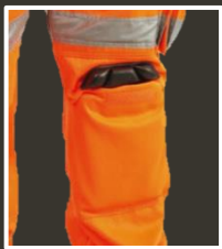
Knee pad pockets

Sizes: 28 - 56 Leg Length: Short (29 inch), Reg (31 inch), Tall (33 inch) and Extra tall (35 inch)