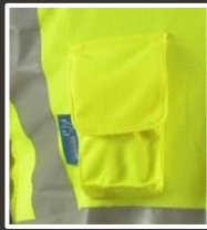
Mobile phone pocket