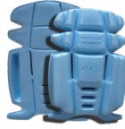
M090 Kneepads (see page 100 for details)